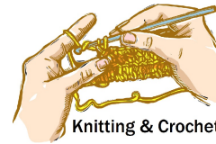
Knitting & Crochet Group

On Saturday, April 9 SHOP, SHOP, SHOP!!!